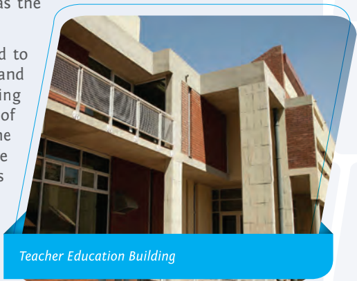
Teacher Education Building

Since 2009 we have been working hard to improve our infrastructure. In 2012 and early 2013, we completed our first building phase of six (6) new buildings, two of which are at the Welkom campus. For the Welkom campus, these two buildings are the first two brick and mortar buildings since 1996 or so – that is 18 years since then, and about 27 years since that campus was established and managed as a Vista University campus.