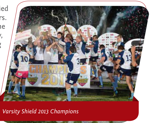
Varsity Shield 2013 Champions

CUT punches much above its weight. The four other universities we compete against – UKZN, TUT, Fort Hare and UWC – have a total of about 300 years of life and experience. But, we beat them hands-down every time. UWC is coming on Monday, 10 February, to be served their staple diet. Come and watch it happen!