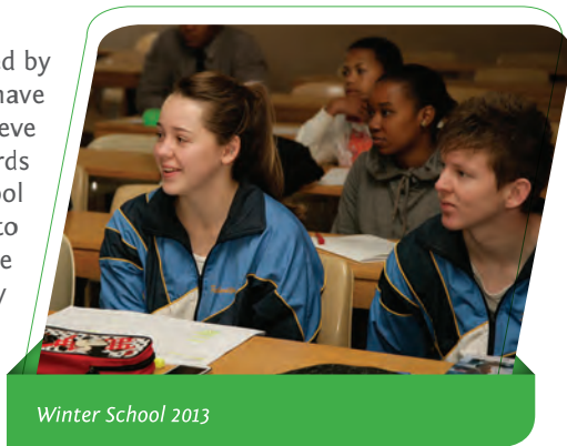
Winter School 2013

The Winter and Spring Schools, mainly hosted by the School of Teacher Education, similarly have produced very good results. I would like to believe that CUT's consistent contribution towards improving the performance of high school learners through CUT-SAA has contributed to some extent towards the terrific 2013 Grade 12 pass rate of 87.4% that was achieved by the Free State Province's class of 2013. We are all proud that the Free State came out on top. CUT pledges to continue to support the provincial education department in improving learner performance.